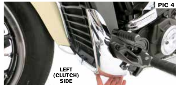
LEFT (CLUTCH) SIDE

STEP 3 Refer to PIC 4. Locate provided Radiator Shroud Accent. Align the accent over the of existing radiator cover.